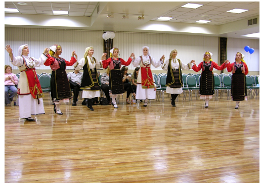
Students of the Hellenic Society of USF perform Greek folk dances