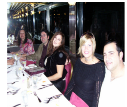
Scenes from the Tampa Center's dinner cruise of February, 2007